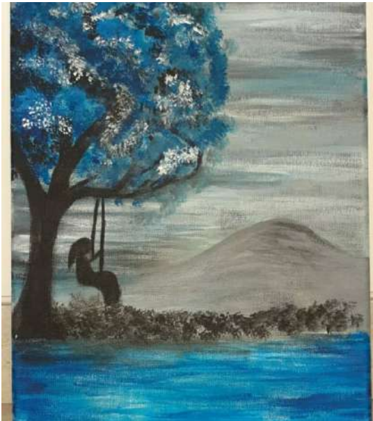
SILHOUETTES BY GRETHI GADIYA, 11-D