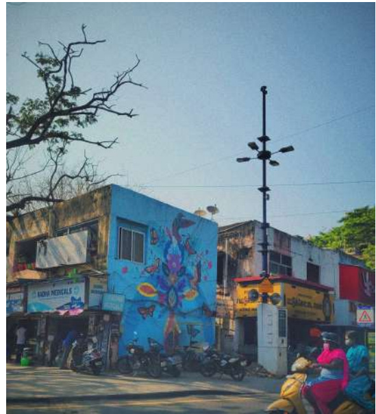
WALL ART BY URJA SETHIA, 11 A