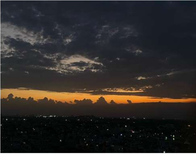
SUNSETS BY JIYA JAIN, 11-B