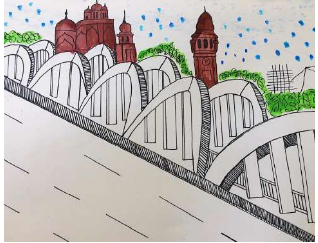
NAPIER BRIDGE BY DEEPTI ASWANI, 11-C